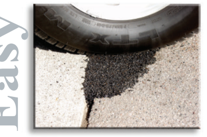
Compact or tamp into place. Open to traffic immediately. It's that simple!