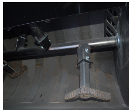
Angled agitation blades to blend and sustain aggregate suspension