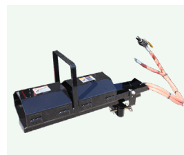
Optional heated swivel chute