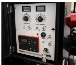
Digital controls for temperature accuracy