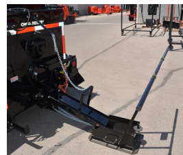
Optional drag box

A large burner, extensive heating surface area and precision thermostatic controls allow more heat to get into the material. Depending on the specific mastic, the Patcher II can melt 1,500 lbs (680 kg) per hour. That 200 gal (757 l) of mastic sealant will achieve 380°F (193°C) temperature and be ready to pour in 2 hours 1 . The Patcher II is the fastest mastic sealant melter available!