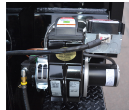
Fuel-efficient and easy-accessible burner